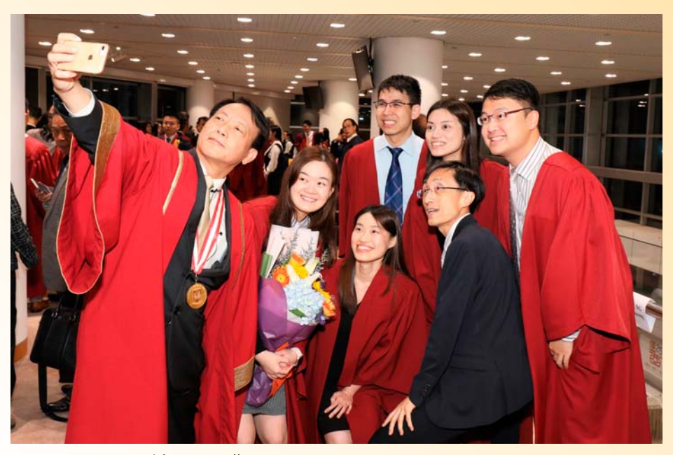
Happy moments with New Fellows