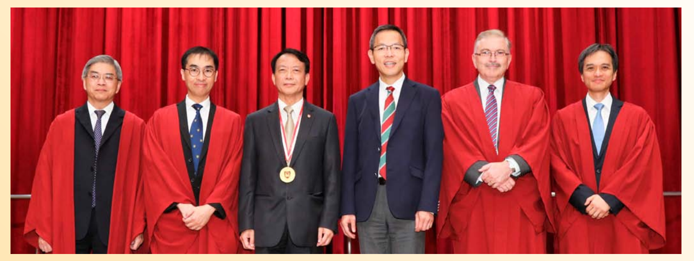
New Fellows of Clinical Toxicology