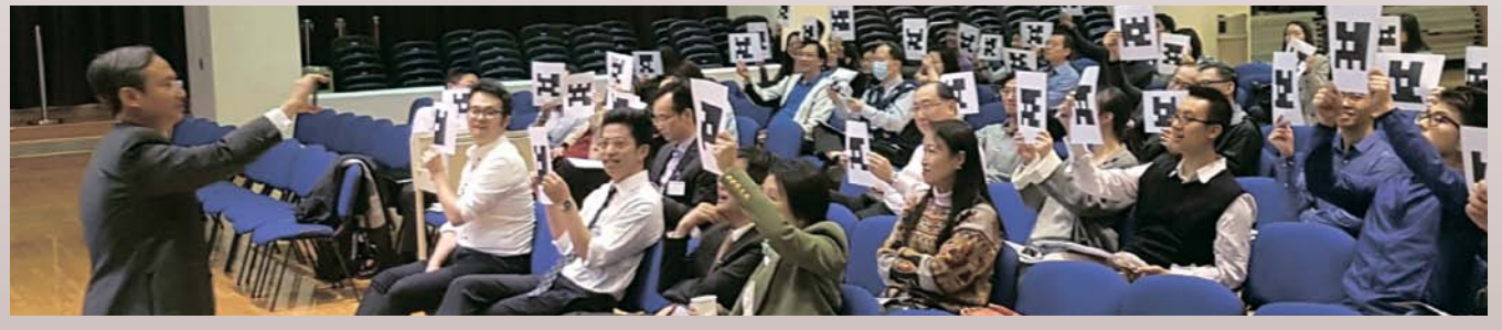
Interactions of the participants with the speaker

support; our committee members for their enormous effort; all speakers for their informative talks; all participants for their interactive discussions and COC (Medicine) for co-organizing the event.