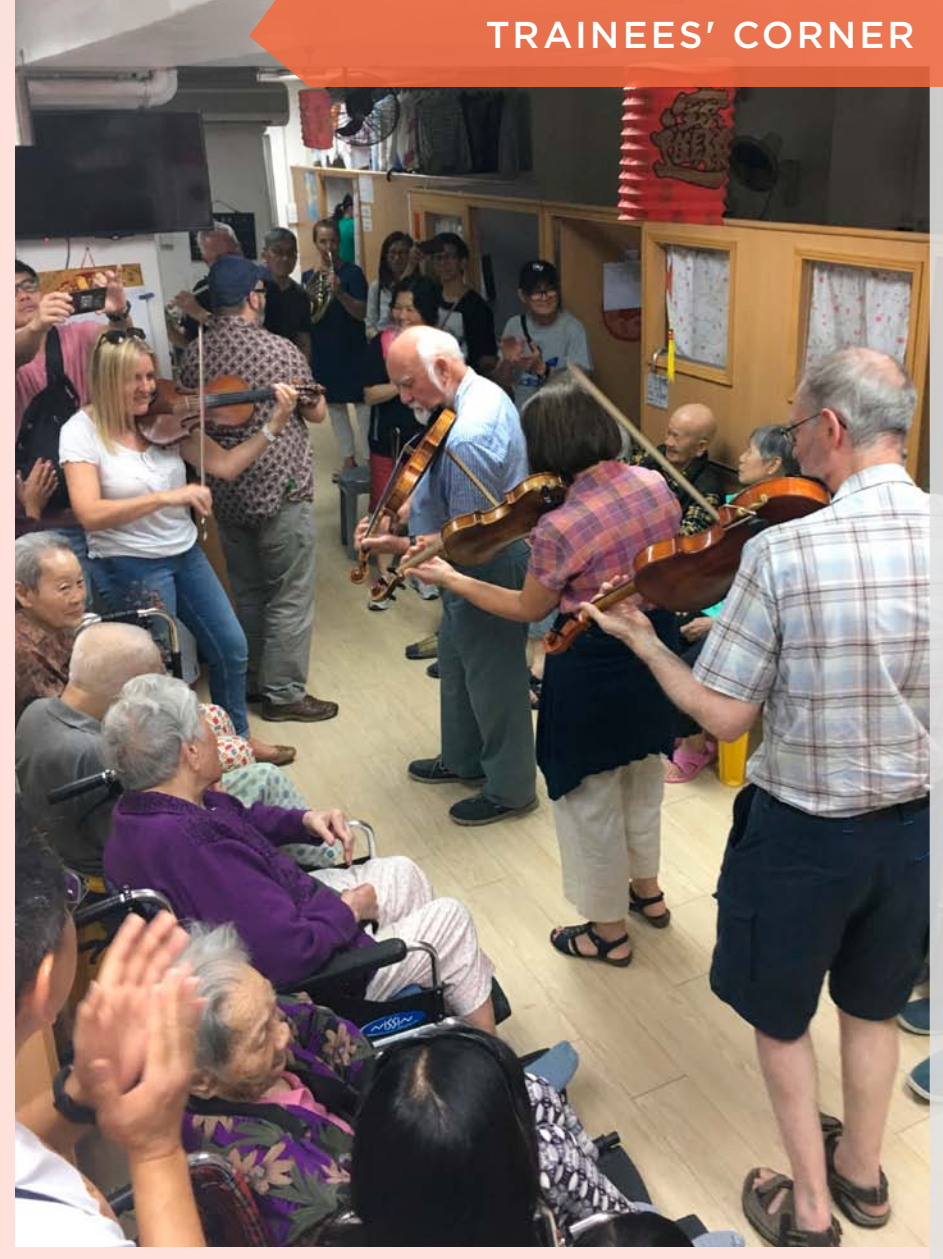
Outreach to an old age home in Wan Chai, September 2018

Many patients and their families were surprised when musicians, playing instruments, such as the french horn, the flute, the violin and the viola, turned up and played as an ensemble by their bedsides. Their response was phenomenal: Nurses later recalled that those with dementia were so much calmer after listening to the music, some who refused to have their bloods taken before the music session would later comply. One of the patients we played to happened to be having her birthday. As we played Happy Birthday to her, it